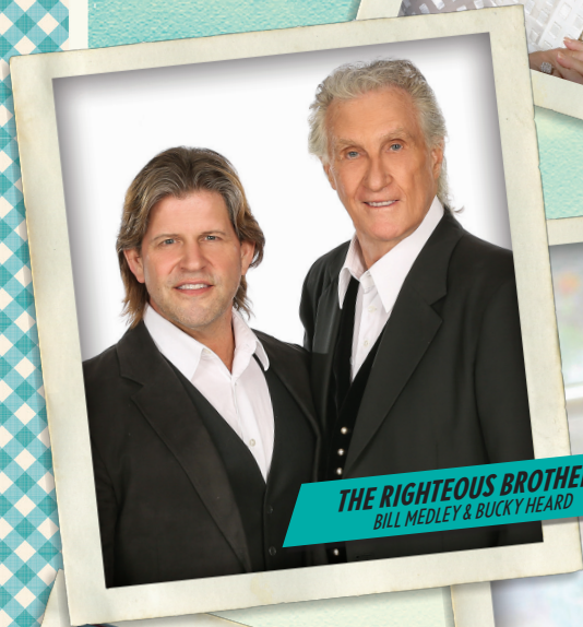
THE RIGHTEOUS BROTHERS BILL MEDLEY & BUCKY HEARD