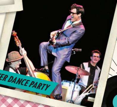
WINTER DANCE PARTY