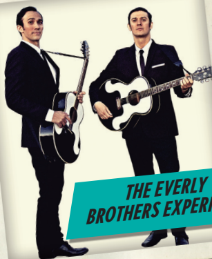
THE EVERLY BROTHERS EXPERIENCE