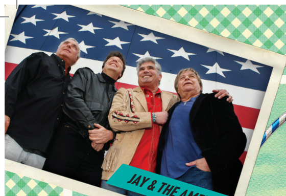
JAY & THE AMERICANS