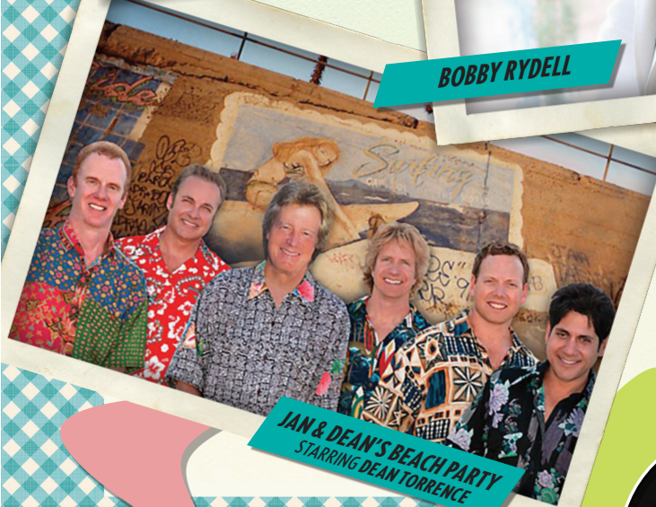
JAN & DEAN'S BEACH PARTY STARRING DEAN TORRENCE