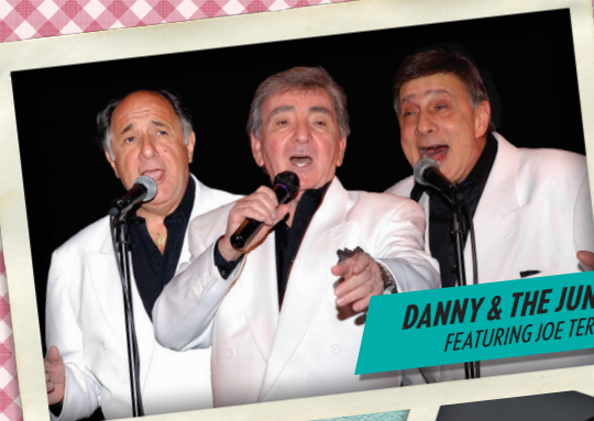
DANNY & THE JUNIORS FEATURING JOE TERRY